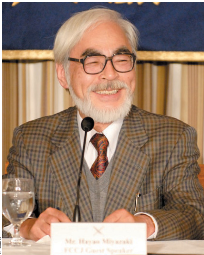
Hayao Miyazaki at the Foreign Correspondents' Club of Japan, November 20

Life has never been easy for either journeyman or veteran animators, and Miyazaki gave some sense of the rigors of his profession. "I have a lack of ability to think of things after only four hours of sleep," he admitted, "or being able to see the fine detailed pictures on my desk, or to be confident that I can spend many hours holding onto a pencil without tiring out my arms." Famously, Miyazaki still draws