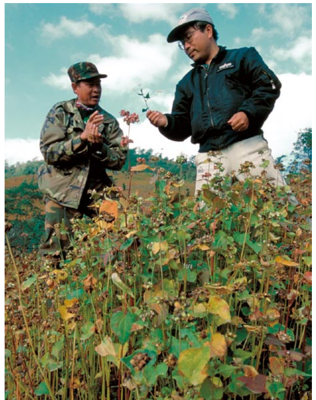
A JICA expert, right, explaining soba-cultivation techniques in Thailand.