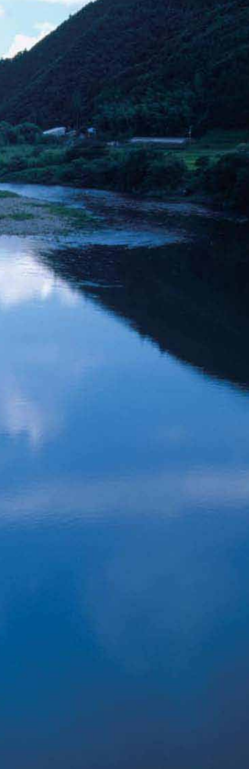
TOP LEFT: The lower reaches of the Shimanto River. Nearing its estuary, the river flows sedately through rural parts of Shimanto City