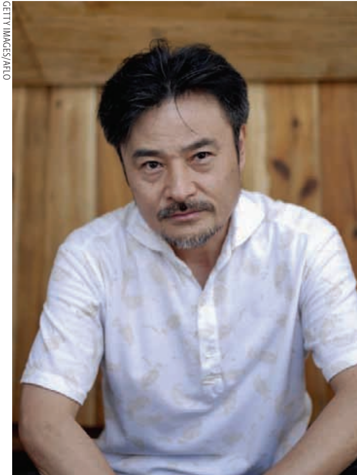
ABOVE: Leading Japanese Film director Kiyoshi Kurosawa.