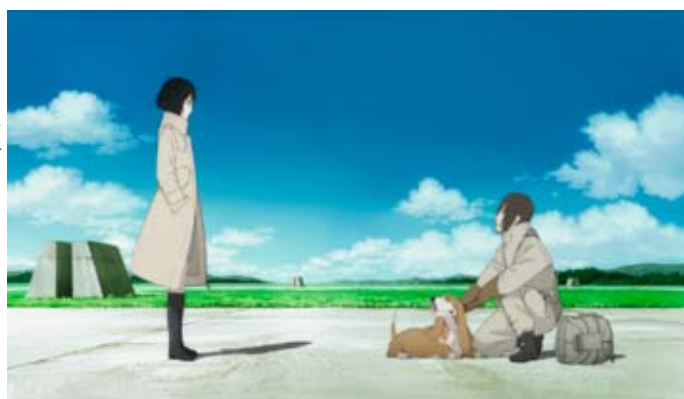
ABOVE: The Sky Crawlers , released in the summer of 2008, is Oshii’s latest animated feature and tells the story of young pilots genetically designed to live eternally in adolescence. It also won the Future Film Festival Digital Award at the 65th Venice International Film Festival.