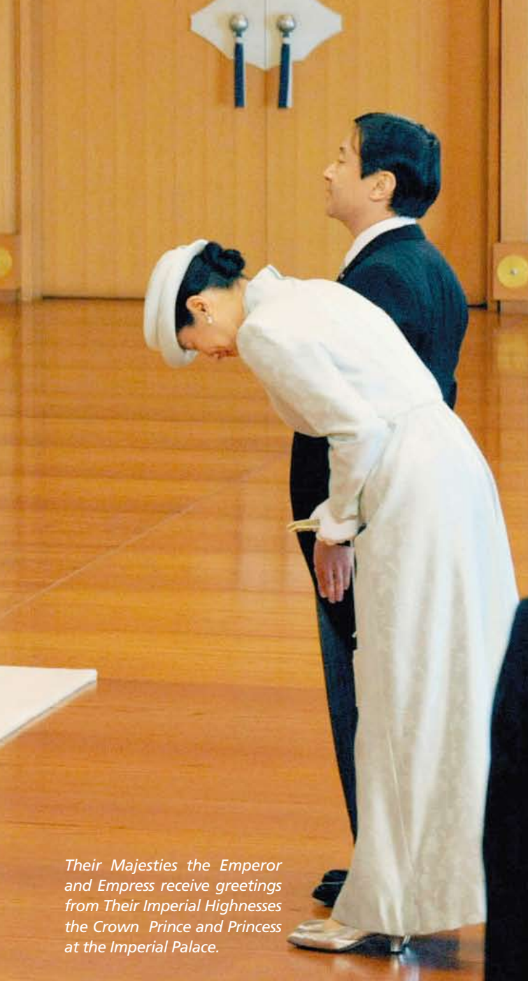
Their Majesties the Emperor and Empress receive greetings from Their Imperial Highnesses the Crown Prince and Princess at the Imperial Palace.

Emperor is sincere, modest, and always broad-minded and has been my mainstay, giving me support during the 50 years I have spent with him.” “For me to be here today by His Majesty's side, welcoming our golden wedding anniversary, it truly seems to me as if in a dream.”