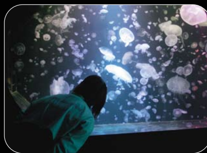
Aquarium visitors enjoy watching jellyfish swim.

emitting crystal jellyfish have now become the main attraction at the aquarium.