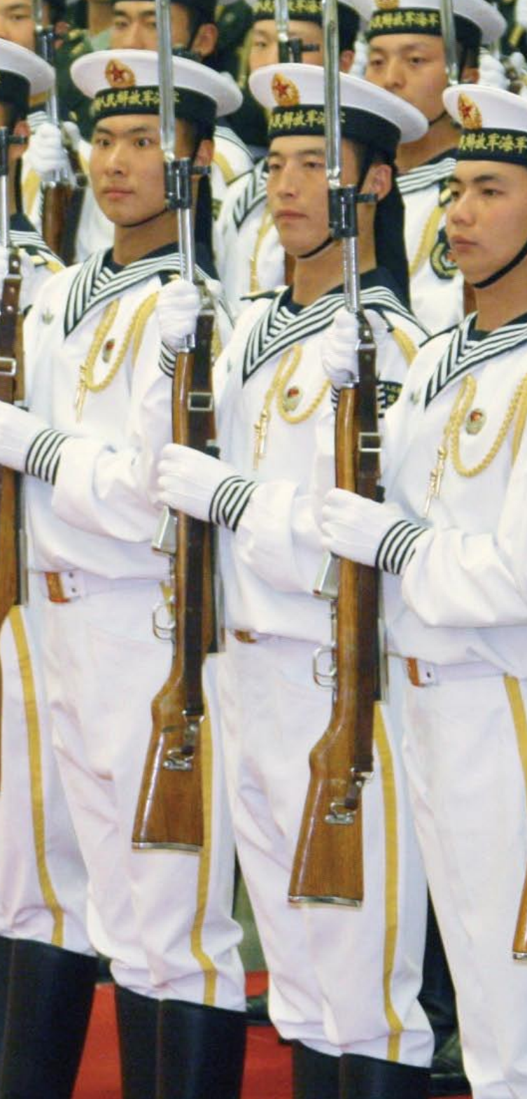
Prime Minister Aso attending a welcome ceremony accompanied by Chinese Premier Wen Jiabao.

countries in the fields of the environment, energy and climate change.