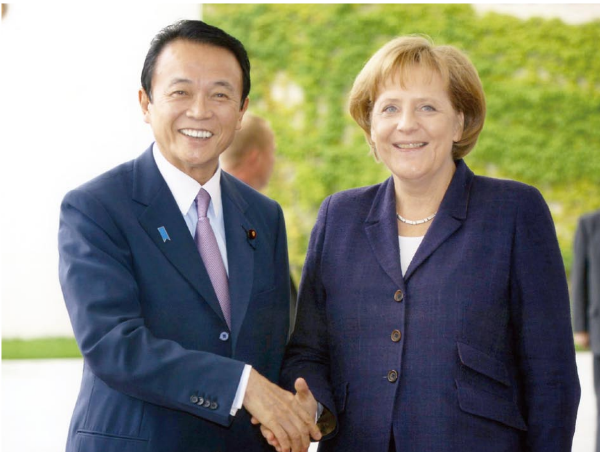
Prime Minister Aso receiving a welcome by Chancellor Merkel at the Federal Chancellery of Germany. Photo Cabinet Public Relations Office.

http://www.kantei.go.jp/foreign/asophoto/2009/05/05germany_e.html