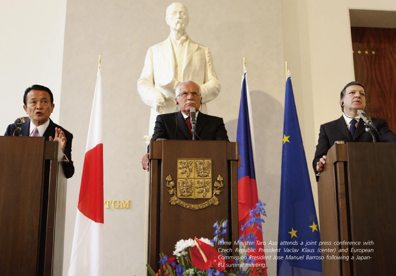
Prime Minister Taro Aso attends a joint press conference with Czech Republic President Vaclav Klaus (center) and European Commission President Jose Manuel Barroso following a Japan-EU summit meeting.