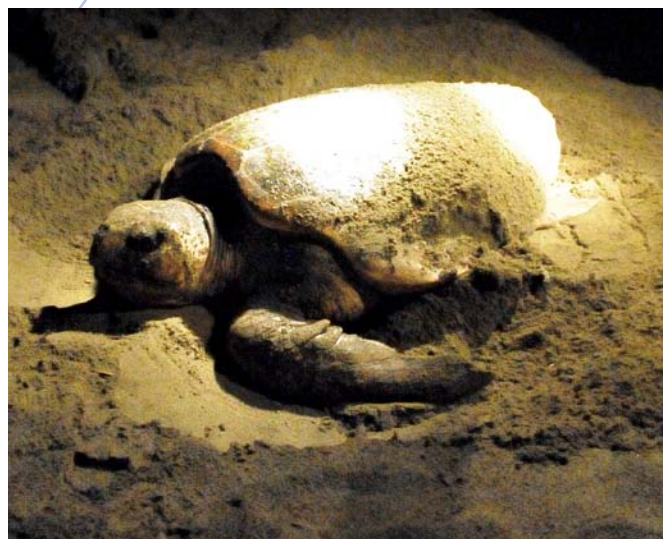
Each year some 30 or so sea turtles come to lay eggs along the Ohama Coast of Minami Town.