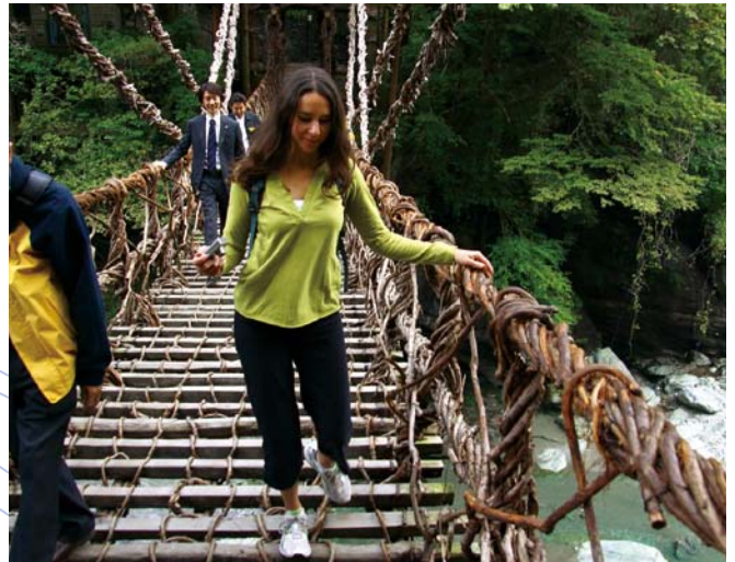
A foreign tourist gingerly crosses the Iya vine bridge.

Last but not least are the many historic Buddhist temples in Tokushima Prefecture. Of the temples that make up the 88-temple Shikoku Pilgrimage, 23 are located in Tokushima Prefecture and Henro pilgrims, often clad in traditional white garb, can be seen making the rounds of these temples in Tokushima's pastoral countryside.