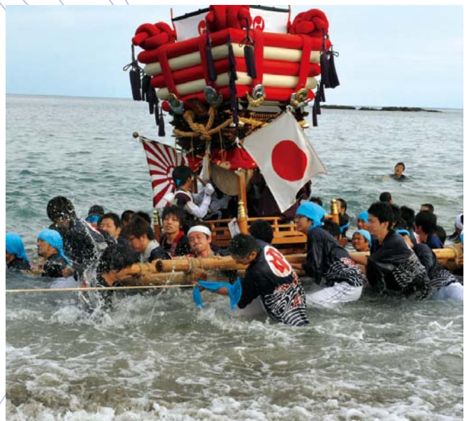
Young men shoulder one of eight taiko drum platforms as they walk along the coastline as part of the Hiwasa-hachiman Shrine's autumn festival in Minami Town, Tokushima Prefecture.