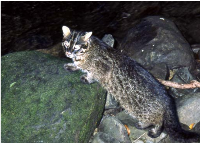
The endangered Iriomote cat, designated as a special national treasure, is endemic to Iriomote Island.