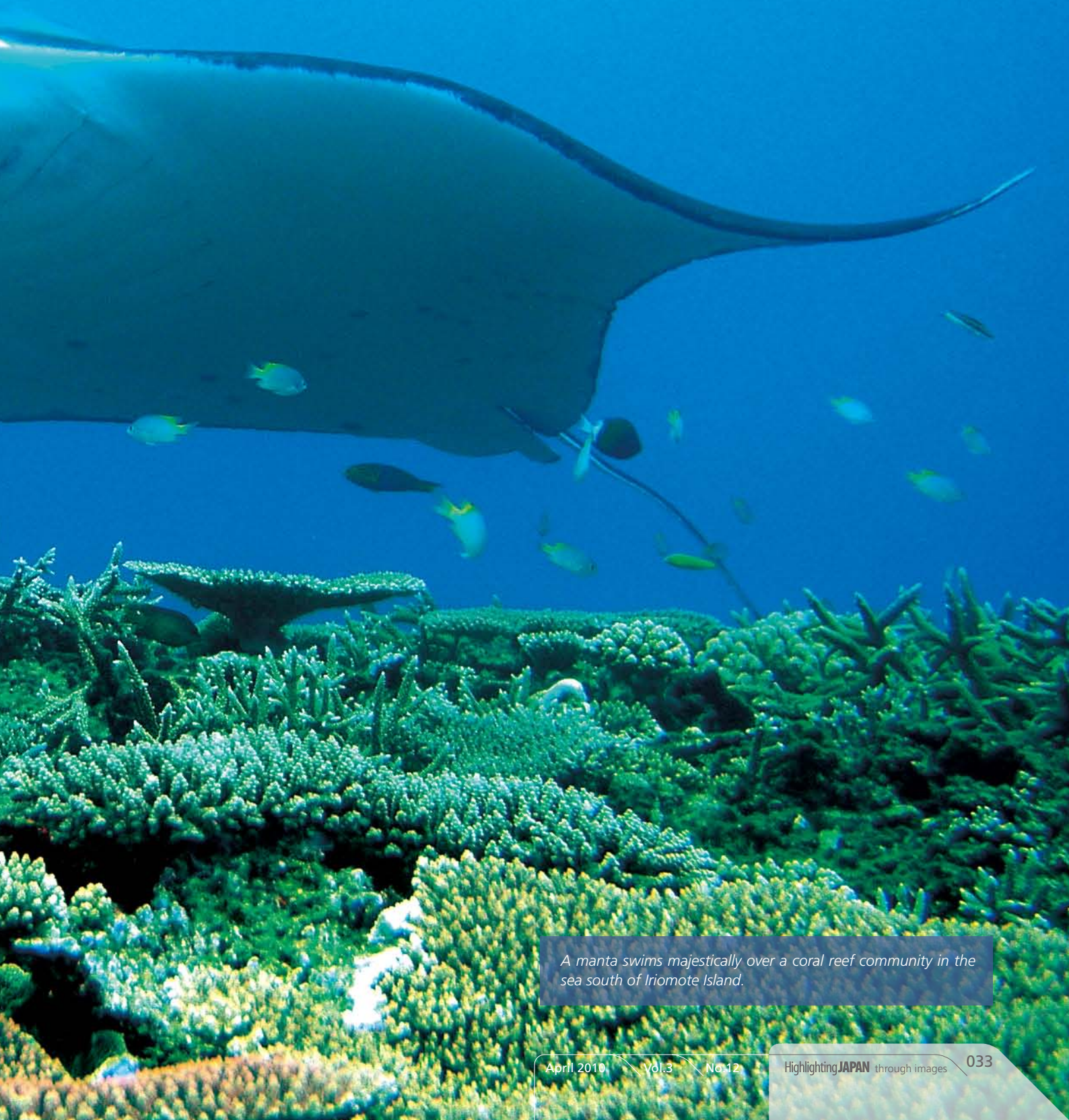
A manta swims majestically over a coral reef community in the sea south of Iriomote Island.