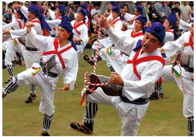
Farmers perform a seed-harvesting festival dance on Taketomi Island.