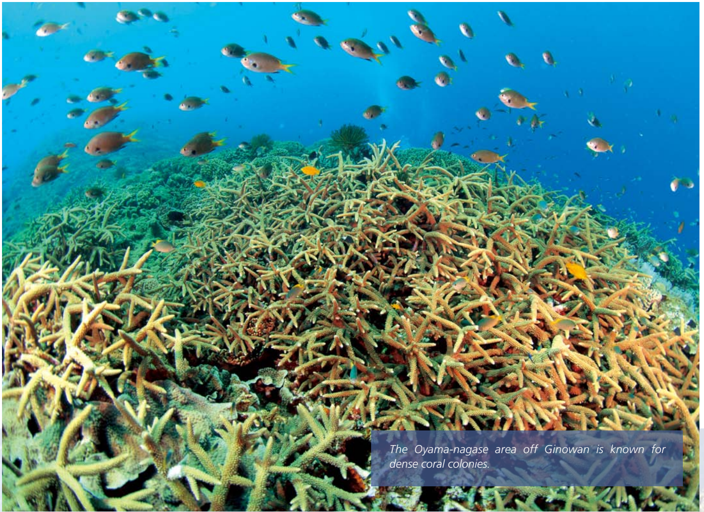
The Oyama-nagase area off Ginowan is known for dense coral colonies.