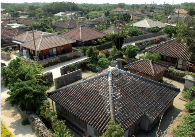
Rows of houses roofed with conventional red tiles on Taketomi Island.