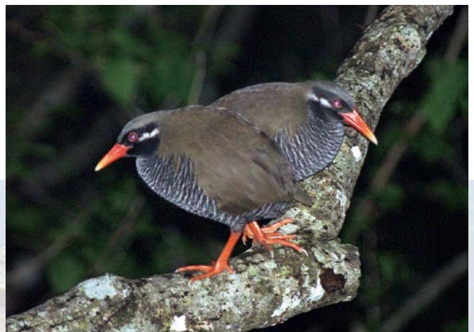
A flightless bird known as the Okinawa rail—an endemic species living only in the Yambaru Forest in the north of Okinawa Island—was discovered in 1981.

the prefectural capital of Naha. This dense forest is where a variety of precious animal and plant species make their homes. These include such endangered species as the Yambaru long-armed scarab beetle, the largest beetle in Japan, and a flightless bird known as the Okinawa rail.