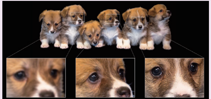
An 8K image features many more pixels than the commonly used 2K image, allowing even the smallest details of the subject to be seen clearly.