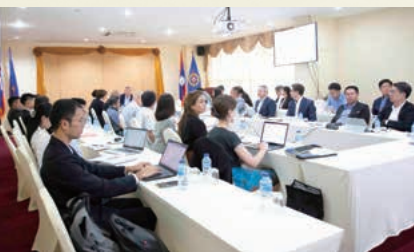
Above: Development Partners Coordination Meeting sponsored by Electricite Du Laos