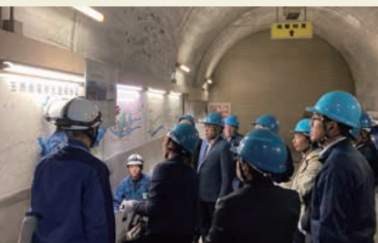
Below: Officials headed by Minister from the Ministry of Energy and Mine in Laos visit a pumped storage hydropower plant by JICA's Invitation Program to Japan