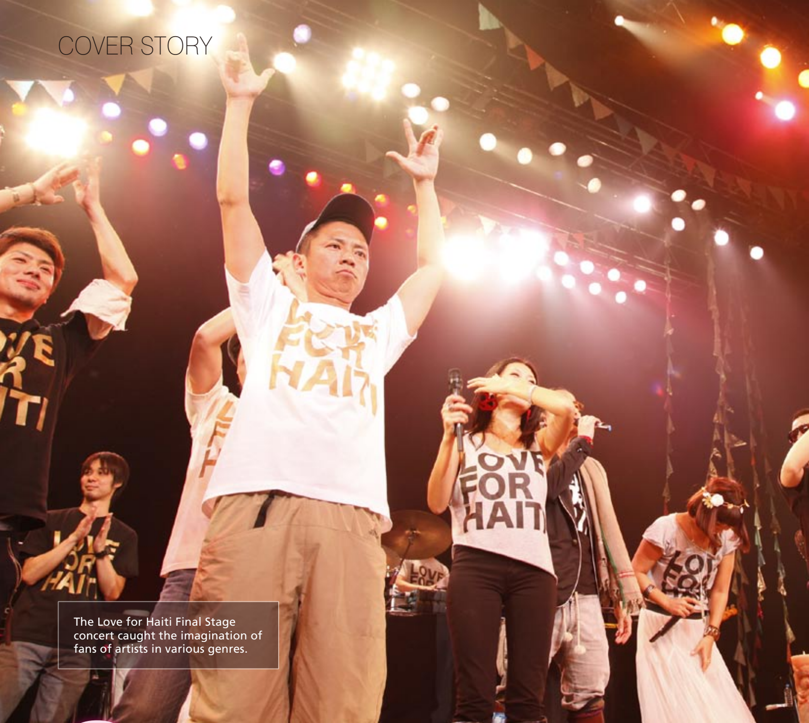
The Love for Haiti Final Stage concert caught the imagination of fans of artists in various genres.