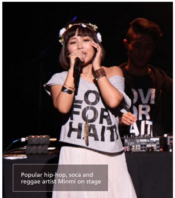
Popular hip-hop, soca and reggae artist Minmi on stage

A woman in her twenties at the concert said, “I came because artists I like were performing, but I was surprised as I had no interest in Haiti before this. I’d like to help in any way I can,” before heading to a collection box in the venue.