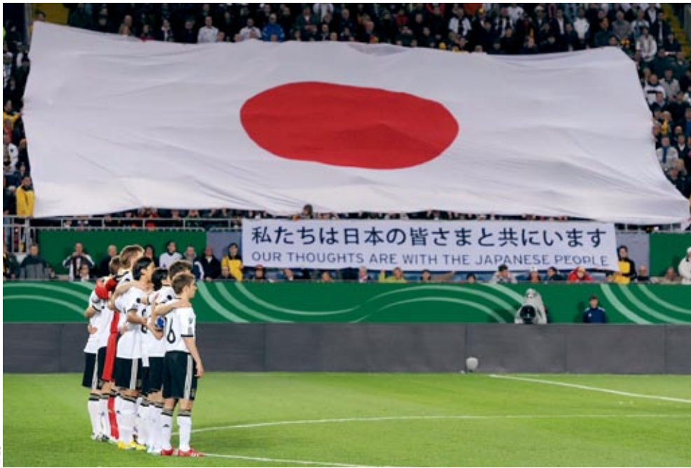
At the Fritz-Walter-Stadion in Kaiserslautern, players of the German national football team observe a minute's silence in memory of those who lost their lives to the earthquake disaster in Japan, March 26.

have taken heart from things such as video messages posted on Internet video sites.