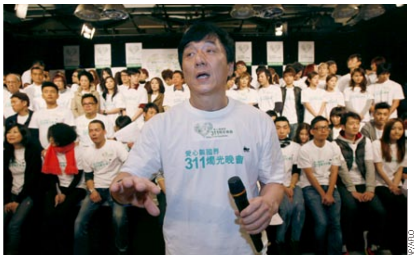
Actor Jackie Chan and scores of other artists attend a news conference in Hong Kong before a charity event in support of the earthquake disaster victims in Japan, March 24.