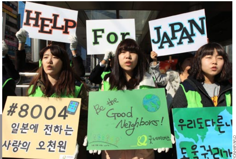
Members of a South Korean charity organization raise funds in downtown Seoul in aid of the victims of the earthquake disaster, March 17.

regions, from the people that have come to Japan for training or received aid from Japan. In the Palestinian territory, the Gaza Strip, which even now is in a tense situation, fifty former JICA training participants