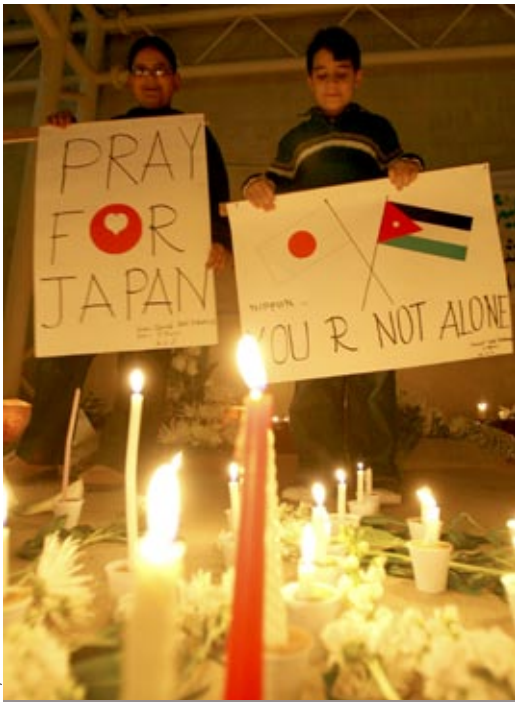
Jordanian boys attend a vigil outside the Japanese Embassy in Amman, March 20.