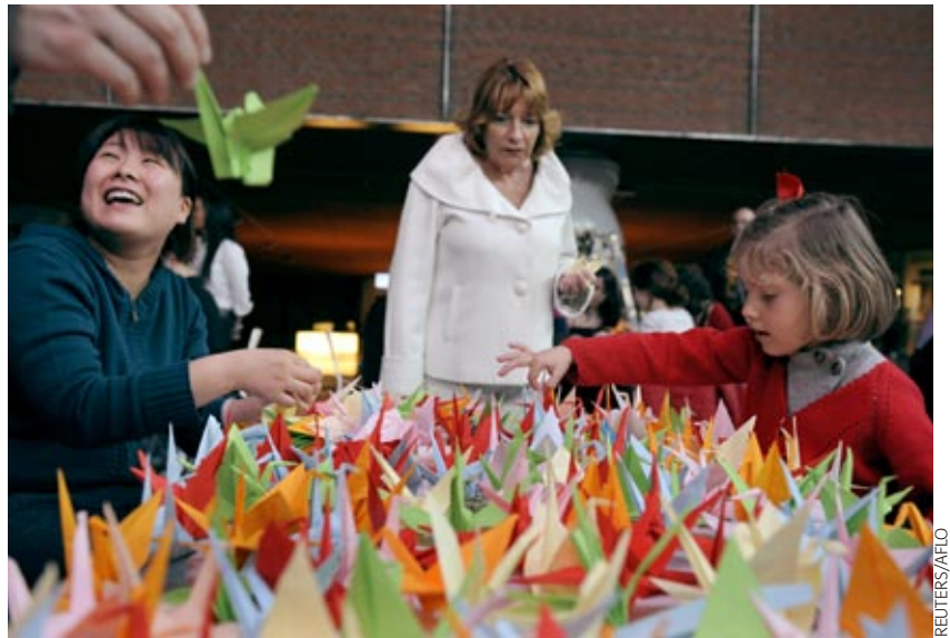
At a culture center in Bilbao, Spain, people help to fold 1,000 paper cranes in support of the earthquake disaster victims in Japan, March 26.