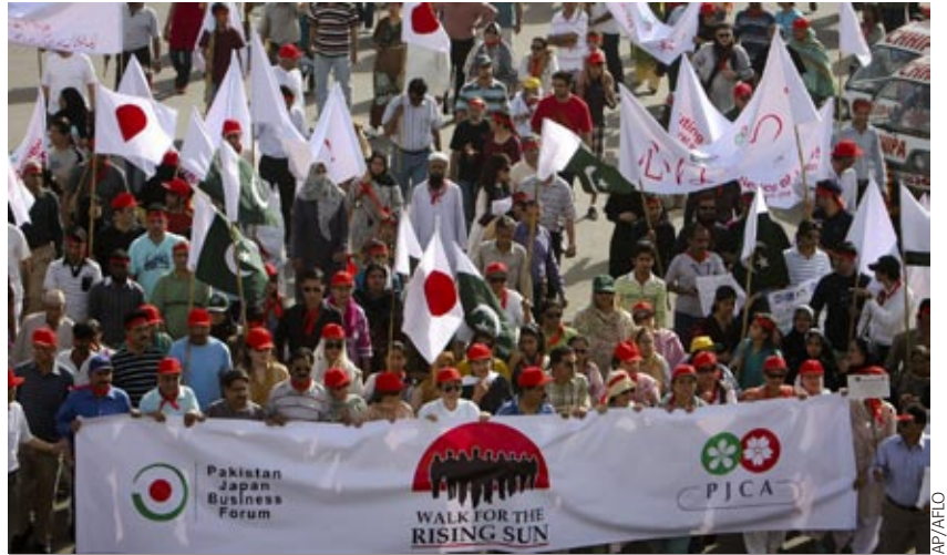
Pakistani families take part in a rally organized by the Pakistan-Japan Cultural Association, March 20.