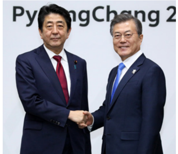
Prime Minister Abe shakes hands with President Moon of the Republic of Korea

Meanwhile, even at this very moment, North Korea continues to persistently pursue its plans for