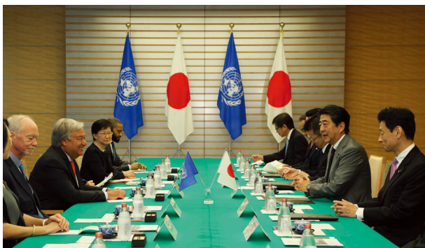
The meeting with the UN Secretary-General

Prime Minister Abe stated that Japan would address various issues in the international community, such as the promotion of SDGs including in the areas of education and health, in cooperation with the UN which was the core of multilateralism.