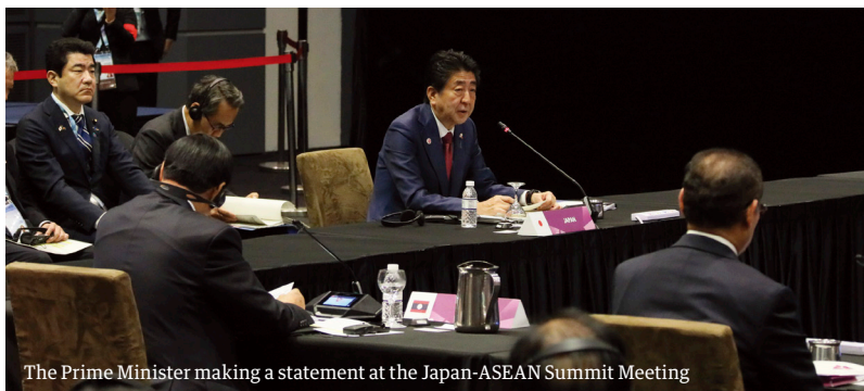
The Prime Minister making a statement at the Japan-ASEAN Summit Meeting

As a standard-bearer of free trade, Japan will promote free and fair rules throughout the world through World Trade Organization (WTO) reform and other measures. From this perspective, the TPP-11 Agreement entering into force by the end of the year is an