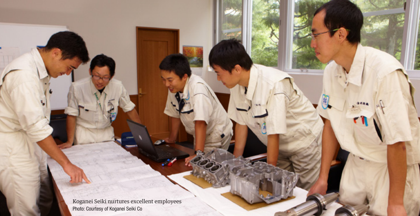
Koganei Seiki nurtures excellent employees

people, we do nothing special. Basically, we treat them the same as Japanese employees, in salaries and social services as well as in regards to the specifics of operation. I speculated that the Vietnamese employees would have difficulty communicating with Japanese workers in the workplace. But, as president, I am only doing things in the usual ways.”