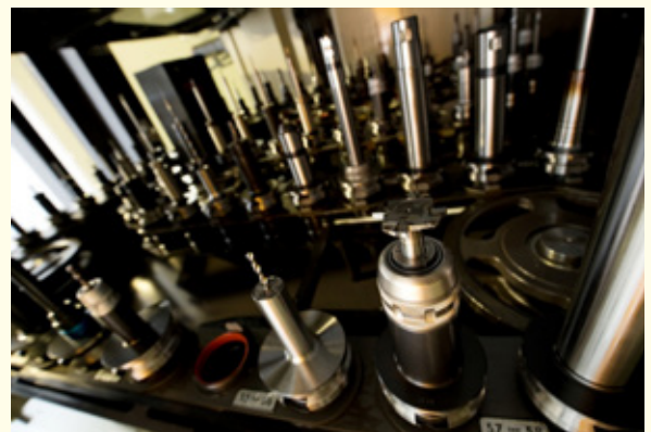
Koganei Seiki manufactures precision parts and components for motorsports applications