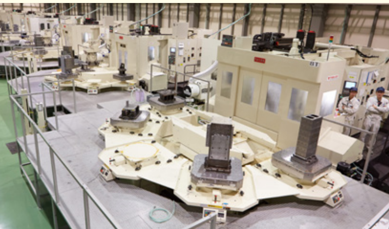
Koganei Seiki’s factory in Maebashi, Gunma Prefecture