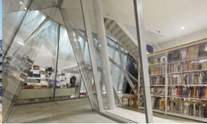
The Sumida Hokusai Museum