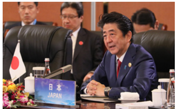
Prime Minister making a statement at the Japan-China-ROK Trilateral Summit Meeting

The three leaders then shared the need to actively tackle climate change and environmental issues in particular.