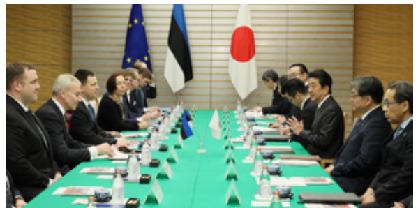
Photograph of the Japan-Estonia Summit Meeting

The two leaders held a wide-ranging discussions on the situations in East Asia and Europe, and confirmed that they will work together to address them. Regarding the situation in North Korea, the two leaders shared the view on continuing to cooperate closely toward the complete denuclearization of North Korea. Prime Minister Abe sought Prime Minister Ratas’ understanding and cooperation for the early resolution of the abductions issue and obtained his support.