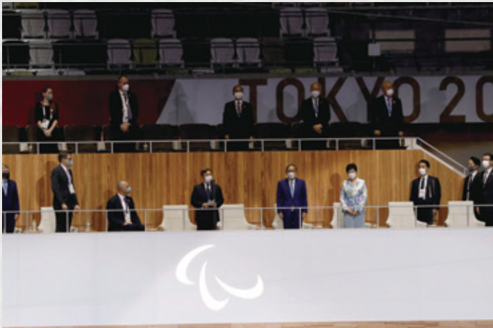
His Majesty the Emperor (center left) declares the opening of the Tokyo 2020 Paralympic Games