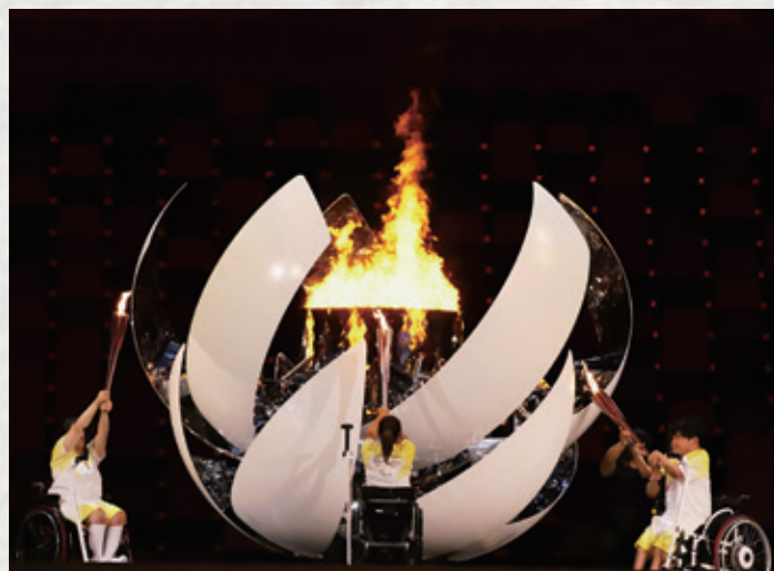
The opening ceremony of the Tokyo 2020 Paralympic Games

I would like to express my deepest respect for the efforts of all athletes who have continued to do their best under such difficult circumstances in order to participate in these Games, as well as the efforts of their families, coaches, engineers, and all those who have supported them. At the same time, I appreciate that managing the Games while taking all possible measures against COVID-19 is far from easy. In particular, the Paralympics may present difficulties that differ from those