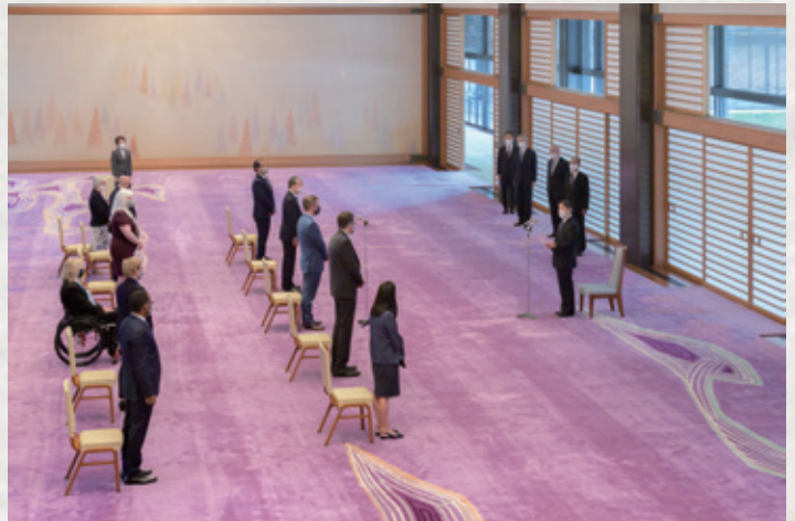
His Majesty the Emperor at the audience with members of the International Paralympic Committee