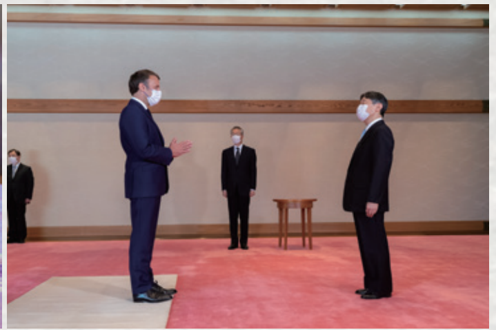
His Majesty the Emperor at the audience with H.E. Mr. Emmanuel Macron, President of the French Republic