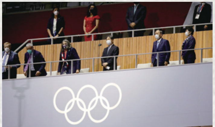
His Majesty the Emperor (center) attends the opening ceremony of the Games of the XXXII Olympiad (Tokyo 2020 Olympic Games)