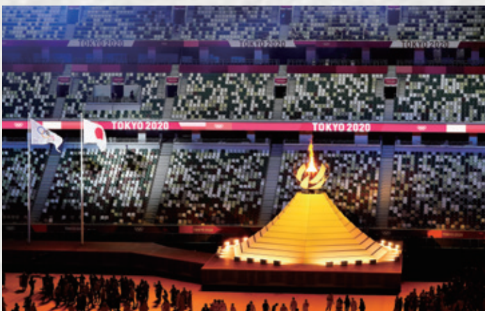
The opening ceremony of the Games of the XXXII Olympiad (Tokyo 2020 Olympic Games)

I declare open the Games of Tokyo celebrating the thirty second Olympiad of the modern era.