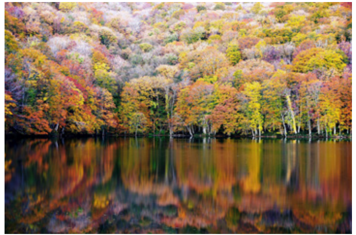
Reflection of multi-colored autumn leaves on Tsuta Numa Lake

Tsuta Onsen, a hot spring in the southern part of the Hak-koda mountain range, is the starting point of a roughly 2.8-kilometer nature trail with observation decking that takes in Tsuta Numa Lake and the six other ponds. In addition to the autumn foliage, visitors can enjoy the natural beauty of the abundant seasonal changes on view at the ponds of varying size and the primeval beech forest.