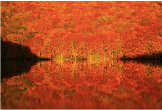
Reflection of the red autumn leaves on Tsuta Numa Lake