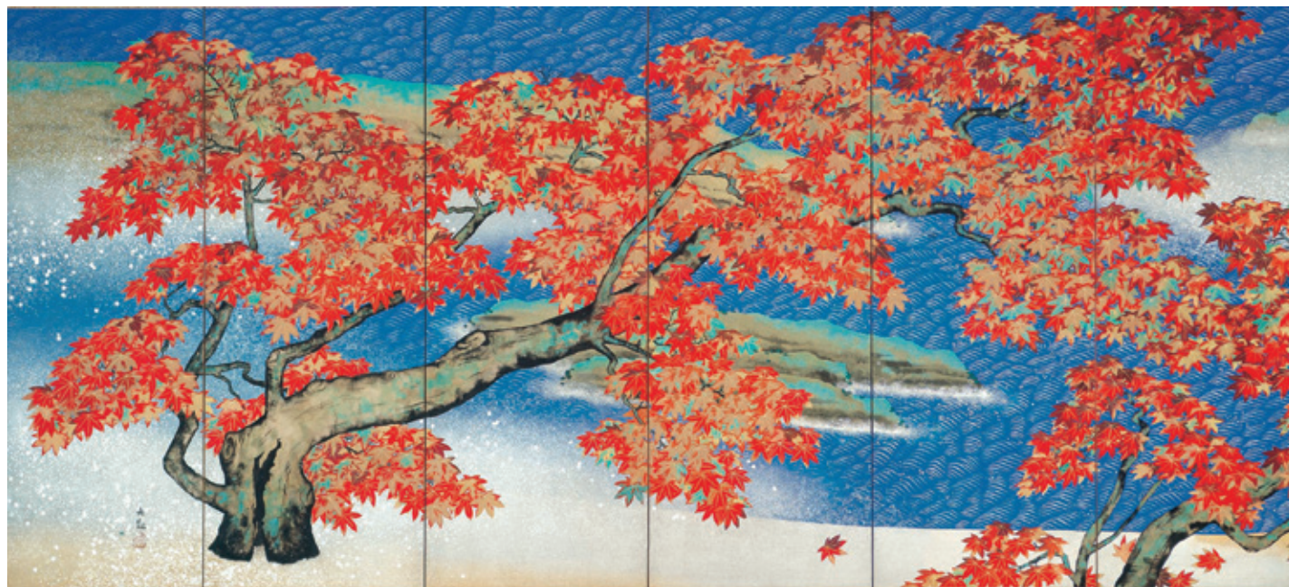
Autumn Leaves by Yokoyama Taikan (left screen)