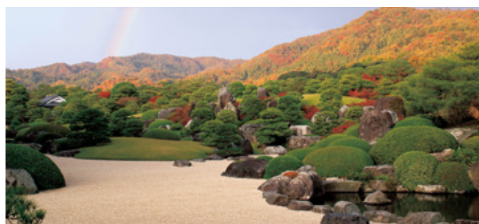
The Dry Landscape Garden at the Adachi Museum of Art in autumn

T HE Adachi Museum of Art in Yasugi City, Shimane Prefecture, is famous both in Japan and overseas for the beauty of its traditional Japanese landscape gardens. The grounds of the museum feature a variety of charming gardens that display vibrant red foliage in autumn, including the main Dry Landscape Garden that incorporates natural mountain scenes behind the garden.