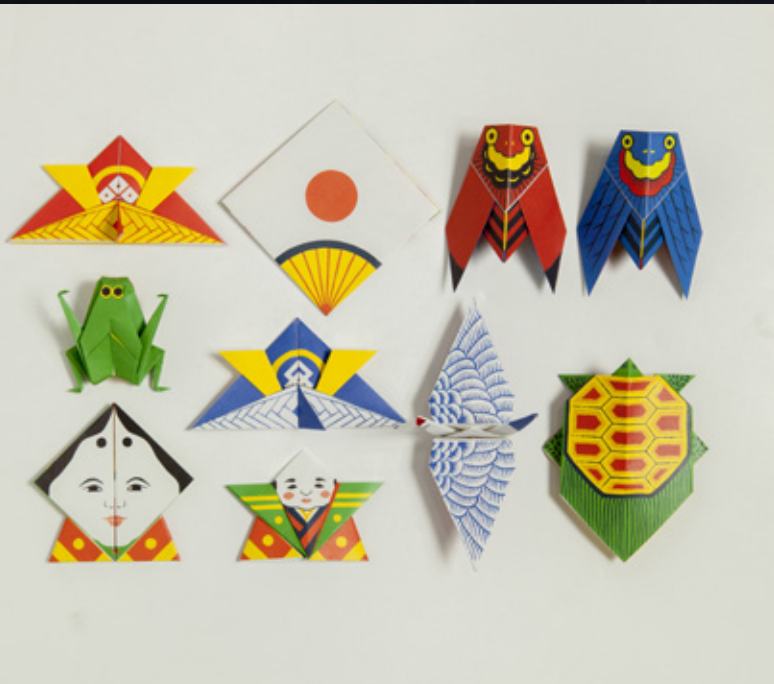
Traditional Japanese motifs such as cranes, turtles, and samurai helmets feature in the Classic Origami series