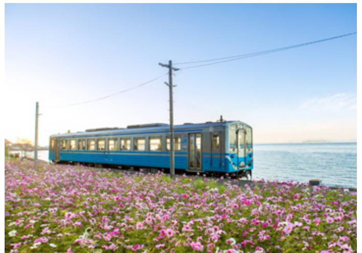
A single-car Yosan Line train