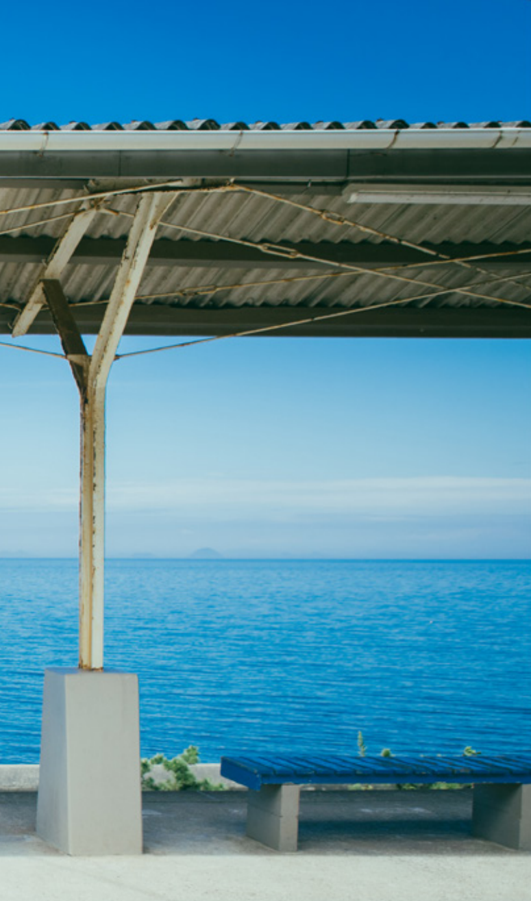
Shimonada Station in Futami-cho, Iyo City, Ehime Prefecture