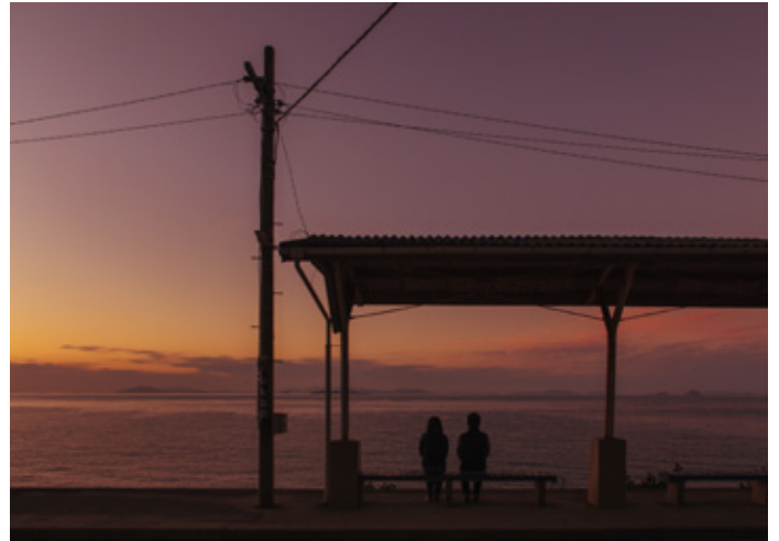
The sunset at Shimonada Station