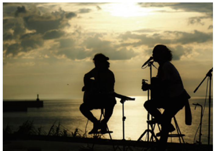
Performers at the (online) 2021 Sunset Platform Concert

and youth organizations about maybe finding a way to use the station's unique beauty to make it a tourist resource. They persuaded what was then the Japan National Railways (JNR), which had expressed concerns about safety, and raised funds from local residents.