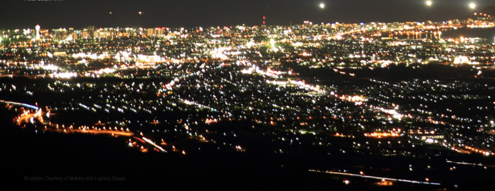
Hakodate and squid fishing boats viewed from Mt. Hakodate