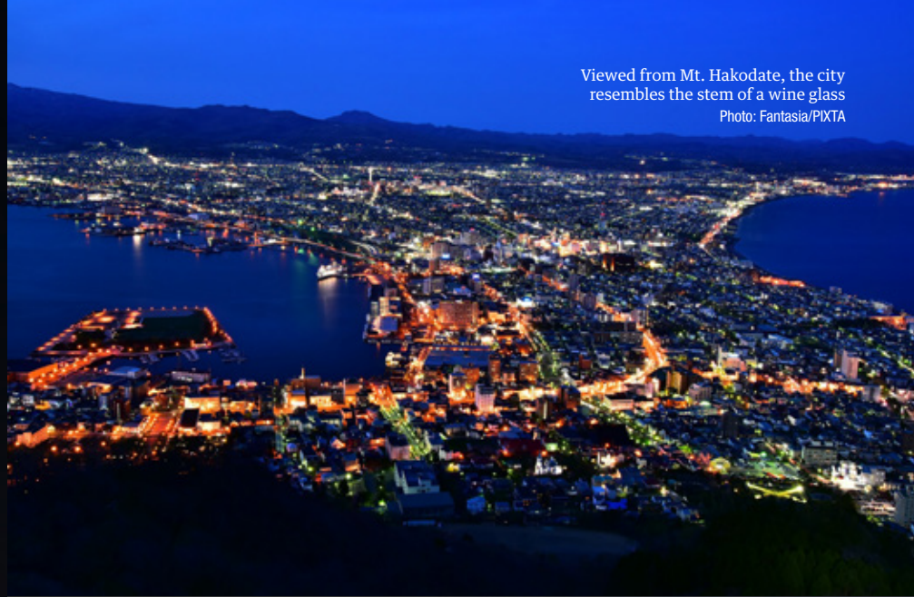
Viewed from Mt. Hakodate, the city resembles the stem of a wine glass

quite different from that seen from Mt. Hakodate. This view is called the ‘horizontal night view’ by tourists and railway fans, and they often come to enjoy this view and compare it to that from Mt. Hakodate.”