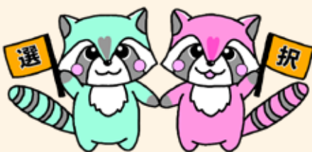
Character of the choice of nationality, Sentan

If a person has chosen the foreign nationality in accordance with the laws of the