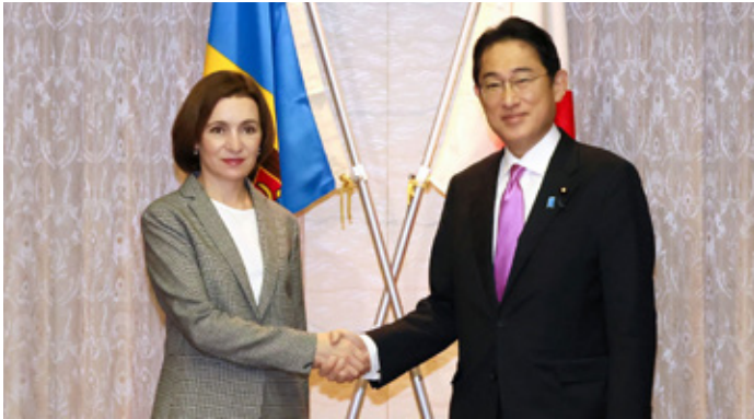
Japan-Moldova Summit Meeting

On December 3, 2022, Mr. Kishida Fumio, Prime Minister of Japan, held a Summit Meeting with H.E. Ms. Maia Sandu, President of the Republic of Moldova, who visited Japan to participate in the World Assembly for Women (WAW!2022). In addition, On December 19, Prime Minister Kishida Fumio held a Japan-Senegal Summit Meeting with H.E. Mr. Macky Sall, President of the Republic of Senegal, who was on an official working visit to Japan. Following the joint press announcement, the two leaders held a working lunch. The two leaders also issued the Japan-Senegal Joint Statement. Overviews of the meetings are as follows: