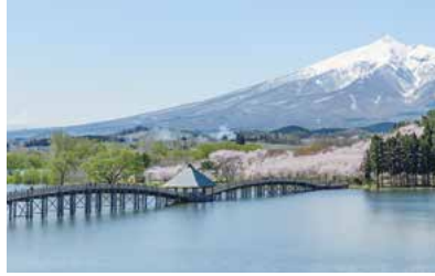
The bridge forms beautiful arches set against the foothills of Mount Iwaki, the “Tsugaru Fuji.”