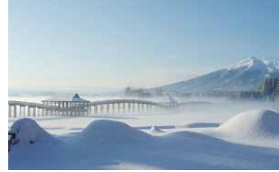
The changing expressions of the Tsuru-no-Mai Bridge throughout the four seasons of Aomori

Shaped like a crane spreading its wings, the Tsuru-no-Mai (“crane’s dance” in Japanese) Bridge blends seamlessly into the lakeside scenery, creating a beautiful sight. Despite its wooden structure, which evokes the image of Japanese traditional style, the bridge is surprisingly new, having been built in 1994. It was constructed over Lake Tsugaru Fujimi for the purpose of monitoring and checking the condition of the water in the lake, which also serves as a reservoir, and for sightseeing purposes.