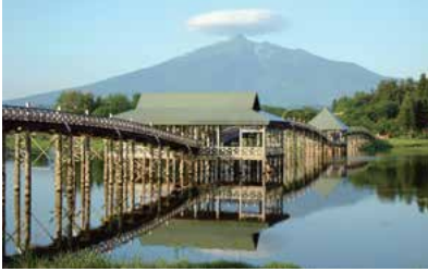
Every 100 meters, at the foot of each arch, there are azumaya stages.