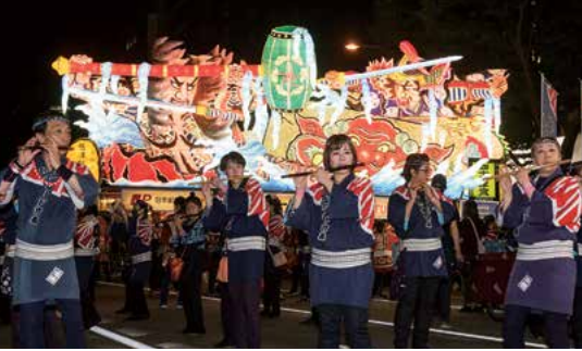
A musical ensemble playing traditional Japanese instruments such as the yokobue (transverse flute) marches along with the nebuta .