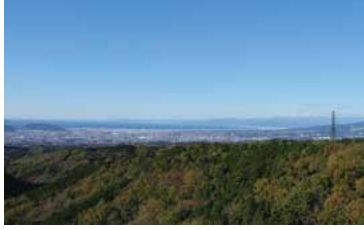
The amazing view of Japan's deepest bay, Suruga Bay, from the Skywalk.