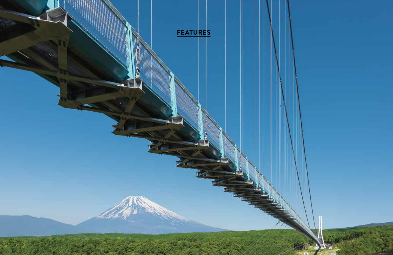
A breathtaking view of Mount Fuji seen from Mishima Skywalk.