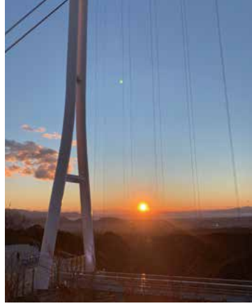
Spaced suspension cables (vertical cables) are an innovation enabling an excellent view.